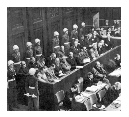
Fig. 5: The Nuremberg trials reveal not only gruesome historical facts but also problems of personal responsibility, which are relevant for the present

Some years ago I tried to make history more interesting, more lively by dramatising historical constellations with students and teachers. Maybe the Nuremberg trials with their great significance for world history are too serious a subject for a class at school to be performed. But there were plenty of other trials closer to every day experience (think for example of the 'denazification'-cases), so that a couple of selected historical facts could inspire a group of pupils to draft some scenes about wrong doing and being called to account. The example of Baldur von Schirach and Richard von Schirach could serve as an example of the conflicts between a son and his NS-father. (By the way: The office in