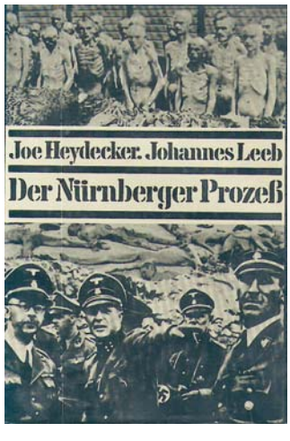
Fig. 4: The Nuremberg trials are a key-event in 'historische Lebenskunde'

this only to point out to some approaches.