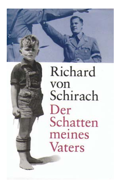
Fig. 3: The son of an NSactor arguing in hindsight with his father

I was born in 1939 and thus belong to the generation of war-children, to whom a huge congress in Frankfurt 2005 was dedicated.<sup>1</sup> My contribution to this congress was not the headlined 'war childhood and historical consciousness' but 'NS-childhood and historical consciousness',<sup>2</sup> because this personal experience